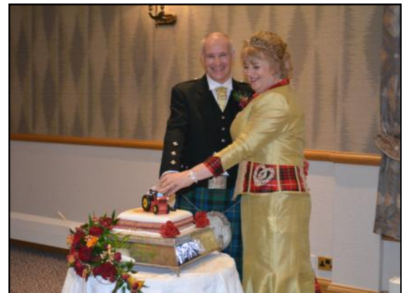
Three generous donations from wedding events