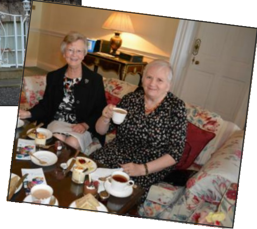
Culloden House Hotel Event